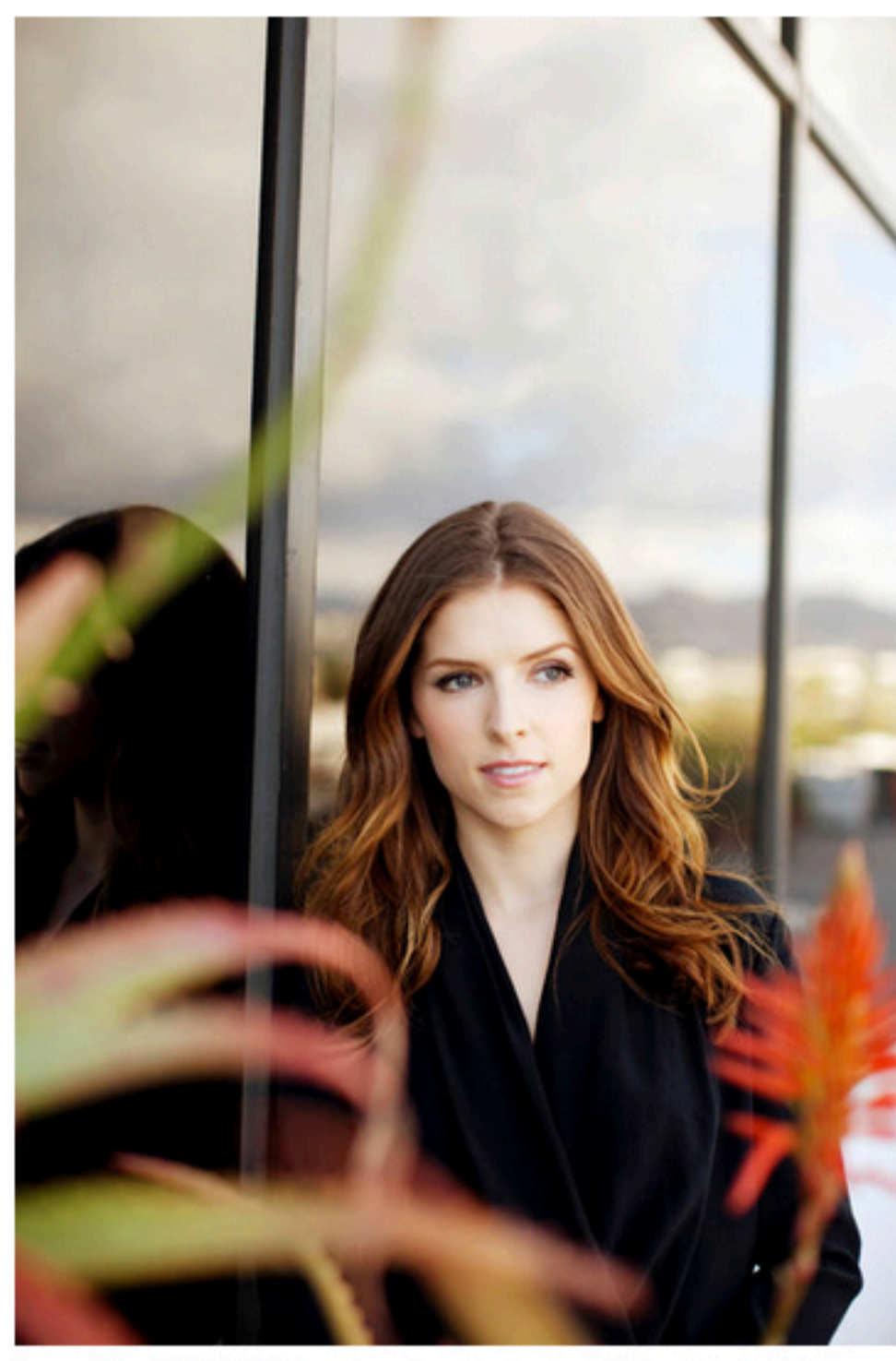
Anna Kendrick, in Los Angeles.