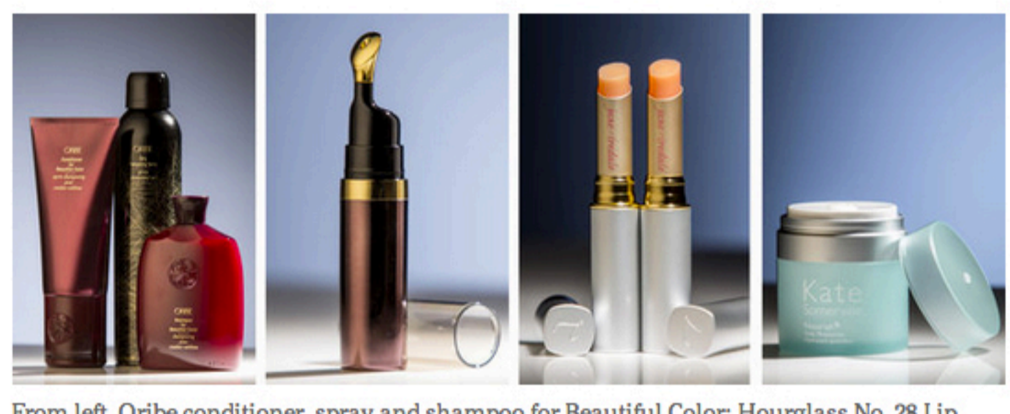
From left, Oribe conditioner, spray and shampoo for Beautiful Color; Hourglass No. 28 Lip Treatment Oil; Jane Iredale Just Kissed lip and cheek stain and Kate Somerville Nourish moisturizer.

I've started using Nars Contour Blush in Olympia. I was so scared of contour — you see girls on Instagram with that shiny, plastic war-paint look — but this one is so subtle. For mascara, I use Guerlain Maxi Lash. It's a great mascara and all, but it smells really good, too. It seems silly, but for a product you use every day, it's kind of a nice touch.